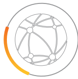
SUPPLY CHAIN SOLUTIONS