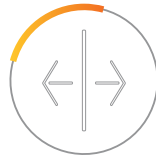
NEW PRODUCT INTRODUCTION