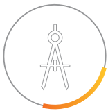
DESIGN AND DEVELOPMENT

Communications and networking is an ever-evolving industry, where “slow to market” can mean “out of business.” Which means you not only need to create high-quality products – you need to get them to market fast. At Plexus, we’ve designed our process with the agility to move as quickly as the market does. We’ll be your global, strategic partner dedicated to helping you meet the increasing demands of a connected world. And we’ll work side by side with your team to make sure what we’re creating will strengthen your brand and improve your competitiveness.