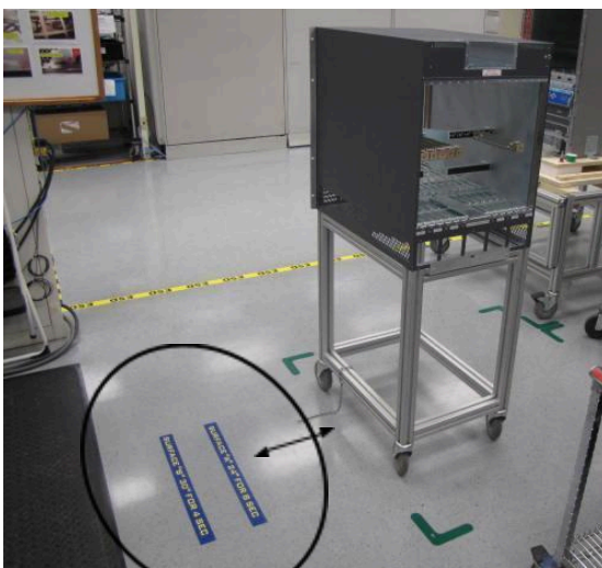
Viewing Distances identified using tape

It may be advantageous to construct a viewing booth or similar arrangement at appropriate quality inspection points within the process flow for the control of lighting, orientation, and viewing distance. Viewing time may be monitored using a conveniently located audible stop-clock. Such an arrangement provides repeatability in the accept/reject inspection process, and helps reduce operator inconsistencies.